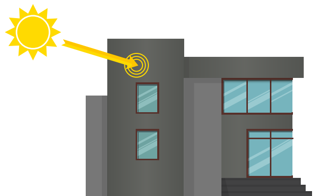
Without Thermo-Reflective Technology Strong solar absorption = High thermal impact

CIN-k Thermo-reflective Technology allows greater freedom in the choice of colour using ETICS for your façade, combining the advantages of greater reflection of solar energy without limiting colour choices.