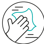
Excellent ease of cleaning